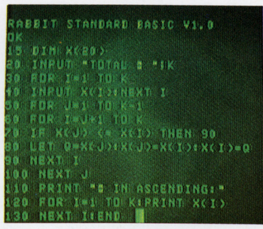
You can write programs in BASIC language to do mathematics or house-keeping records.