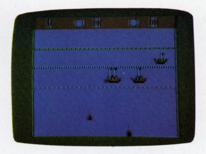
You can write your own game programs later on when you become more proficient in computer software.