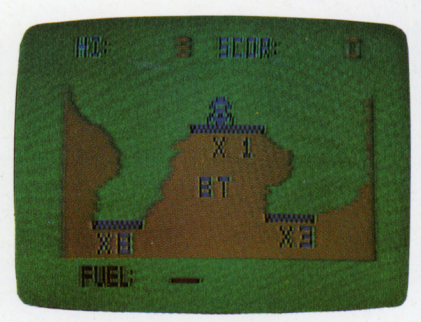
The Rabbit RX83 can handle a lot of video games which are educational and can improve your reaction time.